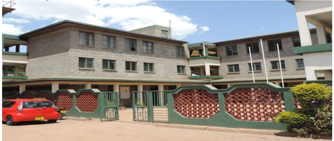
Front view of St. Aloysius New Campus in Langata

Plans were underway by CLC Kenya to construct a new modern structure for the St. Aloysius (St. Al's) Gonzaga School away from the slum of Kibera where it was started. This dream was realized in 2010 when the new modern campus for St. Aloysius Gonzaga Secondary School was opened in Langata area.