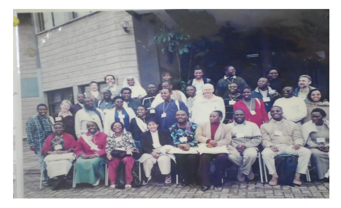
African CLC during the 2003 World Assembly in Kenya

In January, 2004, Hands of Love, with the support of CLC Kenya, began St. Aloysius Gonzaga Secondary School which, to date, serves needy youth who are affected and infected by HIV/AIDS. The school was located in the heart of Kibera slum.