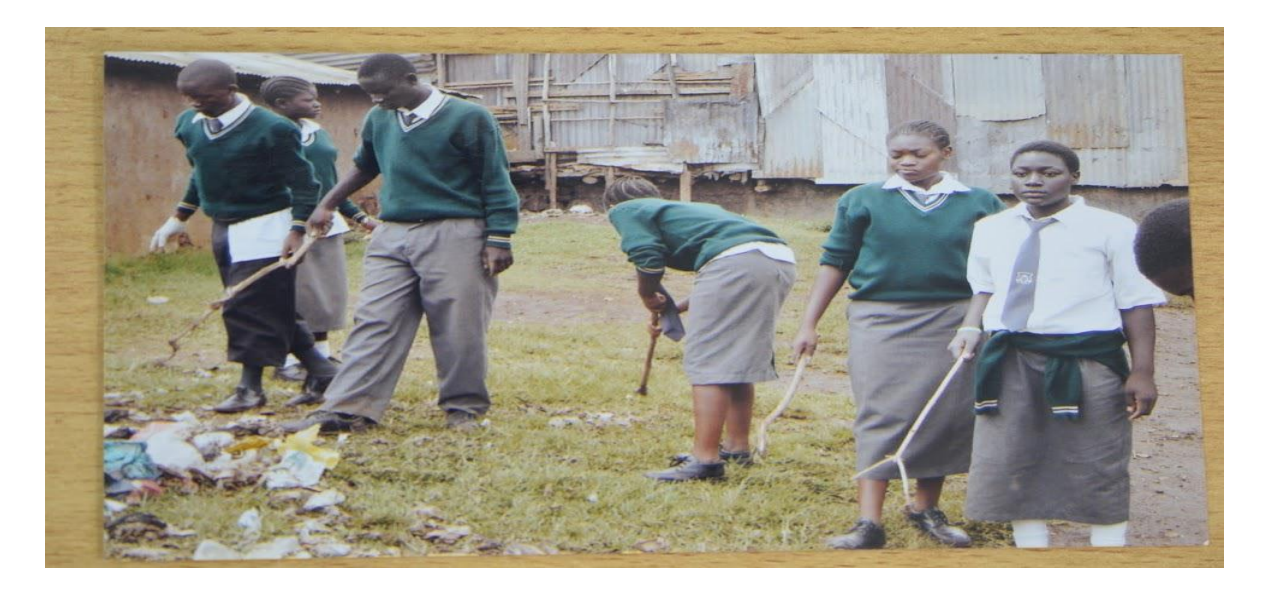
Students cleaning the compound of the old school

In January, 2004, Hands of Love, with the support of CLC Kenya, began St. Aloysius Gonzaga Secondary School which, to date, serves needy youth who are affected and infected by HIV/AIDS. The school was located in the heart of Kibera slum.